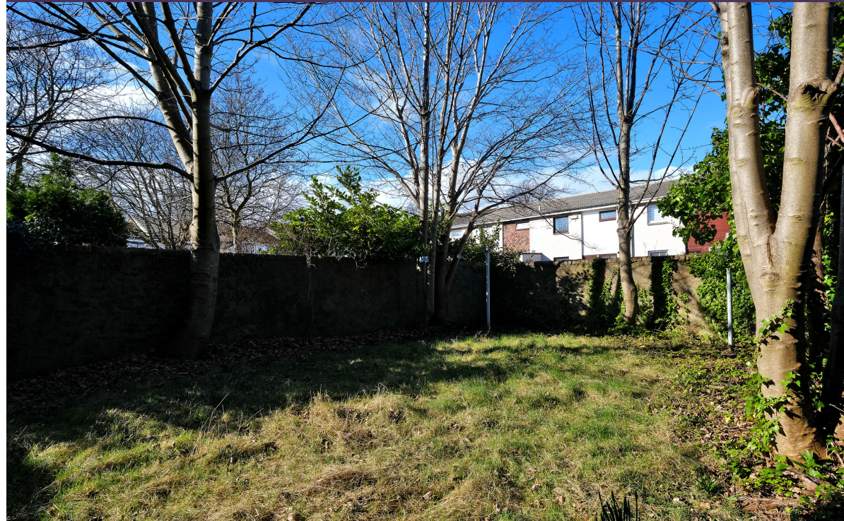
Communal rear garden